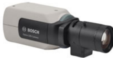
Day / Night Cameras